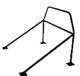
would like to see used