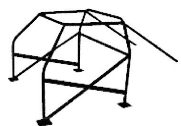
Not Required But Legal to use